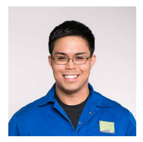
"The instructors all had their own experiences to share and give you as much knowledge as they can, without holding back."