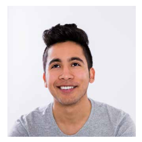
"At VCC, there's small classes, it's easier to ask questions, and it's not as expensive as university."