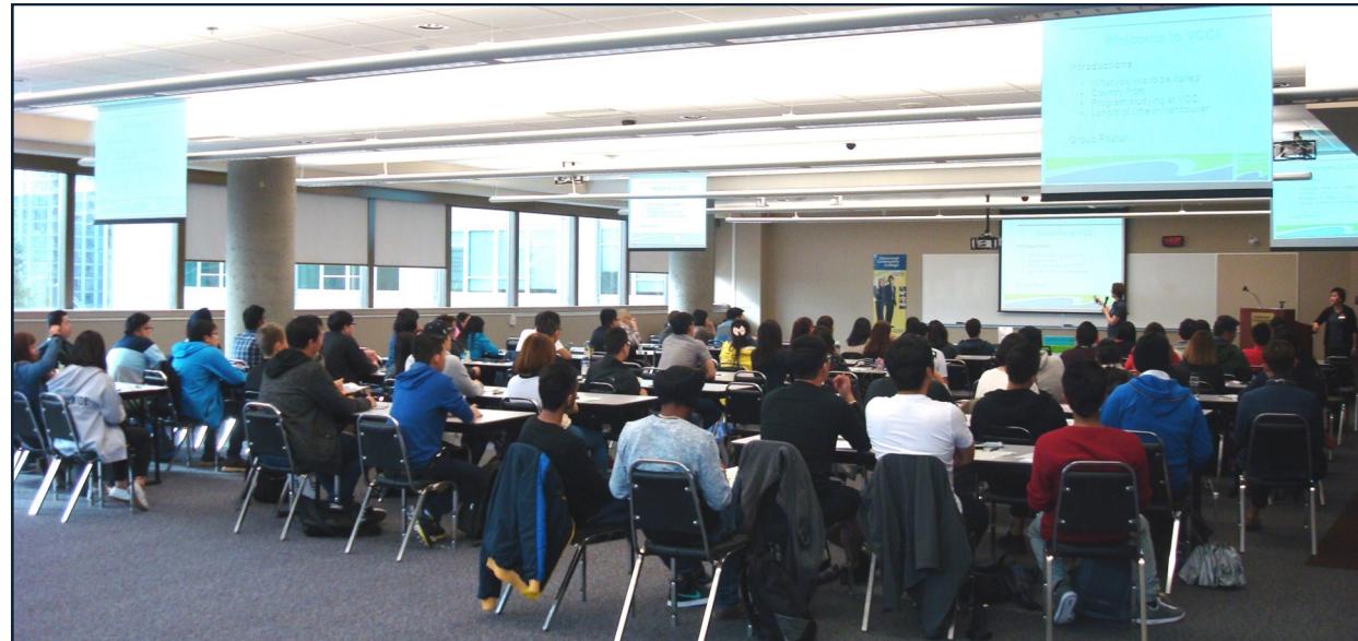
Important information is covered during this two-day event.