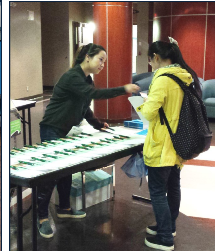
Students checking in, taking photo ID, receiving welcome packages and getting ready to start the VCC International New Student Orientation.